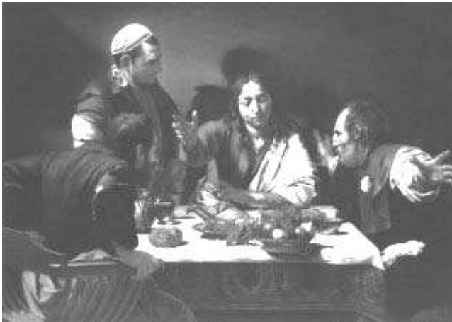
'The Supper at Emmaus.' by Caravaggio.

'When we read the Gospel account, we are drawn into the scene. For Caravaggio the movement is the other way: the scene reaches out to us from the canvas. Look at the outstretched hand of Jesus, the elbow of one disciple and the left hand of the other: they are being projected into our world. And that basket of fruit, full of apples and figs and grapes, symbols of the Fall and the Eucharist: it is about to topple off the table and into our laps. An Easter encounter two thousands years ago reaching out to us through light and shade and the skill of the artist.'